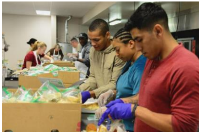
Image: Group of volunteers preparing food for meals.