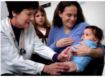
Image: Photograph of a baby receiving a vaccination from a physician.