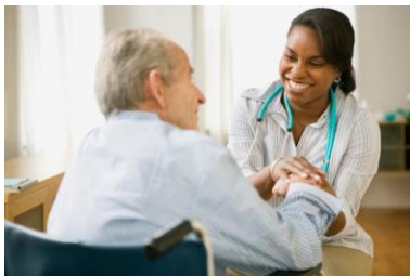
Image: Physician working with elderly patient.