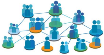
Image: An illustration of a network of individuals and groups of people.